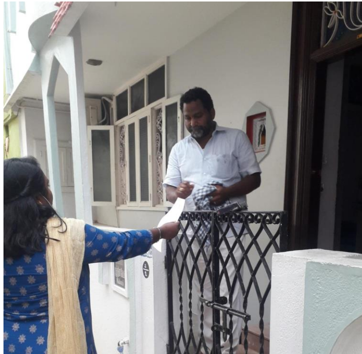
Door to Door notice distribution – Sample photos